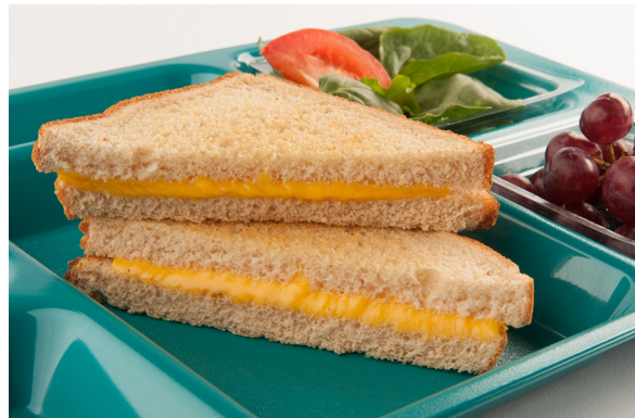
1 serving of Grilled Cheese Sandwich (1 oz. eq.)